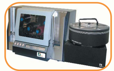
Optional 6-hopper carousel